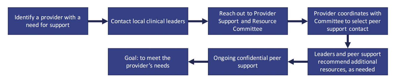
Fig 2. Peer support flow diagram as coordinated by the Baylor Scott & White Health Provider Support and Resource Committee.

The Carolinas Healthcare System (CHS) is a not-forprofit health care system comprising more than 900 health care locations, including academic medical centers, hospitals, ambulatory surgical centers, and nursing homes in North and South Carolina. The institutional approach to burnout within CHS is packaged in the LiveWELL (Work, Eat, Learn, and Live) program. This program has representatives available at all of the major CHS facilities and a resource-laden web site with informational videos, intramural calendars, and fitness programs. The LiveWELL program also promotes stress management through LetsTalk events that teach participants resilience techniques and strategies for reshaping thoughts and mood. A confidential Employee Assistance Program is also available for short-term, solution-based counseling over the course of up to 6 sessions, at no cost to the physician. The Employee Assistance Program also hosts a monthly webinar series that covers topics related to burnout and resilience, including time management and goal setting, single parenting, and dealing with