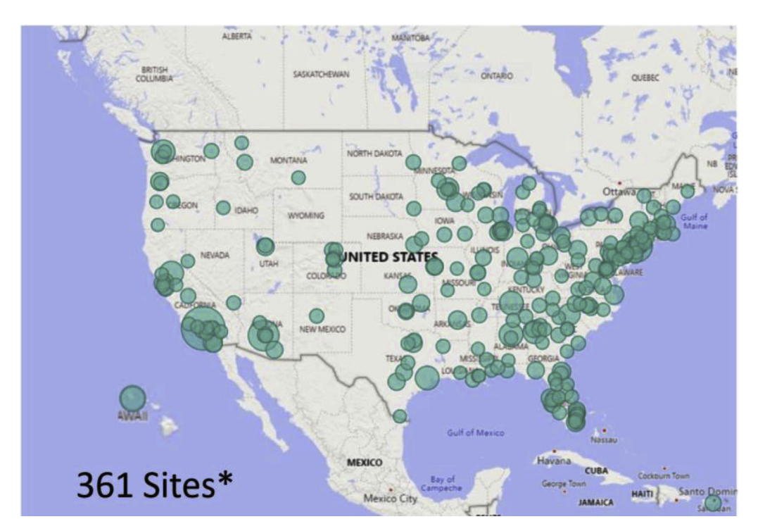
Figure 2. Number of STS/ ACC TVT Registry sites performing transcatheter mitral valve repair with the edge-to-edge clip device. *As of July 28, 2019. (STS/ ACC TVT, Society of Thoracic Surgeons/American College of Cardiology Transcatheter Valve Therapy.)

percentage of active transcatheter MV intervention programs whose yearly volume falls below the minimum requirements outlined in this document.