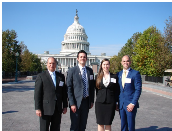
STS members from Michigan participated in the Fly-In.

Even though the Fly-In is over, it's not too late to advocate on behalf of the specialty. E-mail advocacy@sts.org for information on hosting a site visit or meeting with legislators in their home offices.