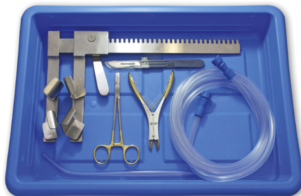
Fig 3. Recommended emergency resternotomy set.

Emergency resternotomy is required for 20% to 50% of cardiac arrests after cardiac surgery [8, 14]; and it is a multipractitioner procedure that should ideally be