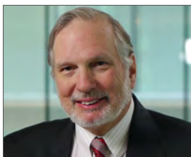
Joseph E. Bavaria, MD Valve-sparing aortic root procedure – reimplantation

Experience a procedure “wheels in” to “wheels out” as a world-class surgeon brings you into an operating room, talks you through his/her thought processes and operative techniques, and demonstrates the difference between good outcomes and masterful ones. Attendees will be able to see who’s in the room, how they are positioned, and what equipment they are using—all without traveling to another hospital. A moderator will discuss with the master surgeon critical aspects of the procedure, drive the 360° views, and engage the audience for interactive discussions throughout each session.