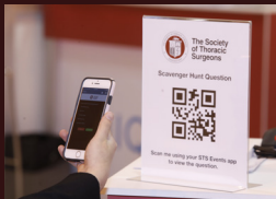
Exhibit space applications are accepted through the online Exhibitor Center. If you previously exhibited at an STS Annual Meeting, you can use the same password. If you are a new exhibitor, you can create an account by clicking “My Account” in the left side navigation. Completion of your online application includes agreeing to the Society’s Exhibit Terms & Conditions.