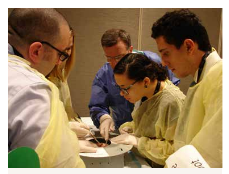
The popular course provided individual instruction from experts in the field.

After listening to talks on the projected needs of CT surgery and the 6-year integrated CT surgery program, attendees participated in hands-on wet labs covering aortic valve replacement, off-pump coronary artery bypass grafting surgery, video-assisted thoracoscopic lobectomy, chest wall reconstruction, and more.