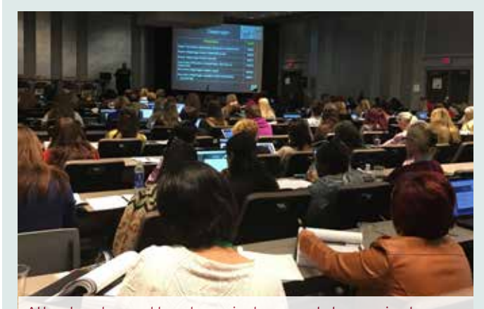
Attendees learned how to navigate several changes in store for 2017 coding and reimbursement.

In addition to reviewing new and revised 2017 codes for each subspecialty, attendees learned about the new Merit-Based Incentive Payment System, a Centers for Medicare & Medicaid Services (CMS) proposal to implement a mandatory coronary artery bypass grafting payment bundle, and the new CMS reporting requirements for 10- and 90-day global services. ■